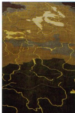
The Blue Gold rug by Bev Hisey maps Canada's lakes, rivers and tributaries in hand-knotted silk. $6,500. At Made or bevhisey.com.