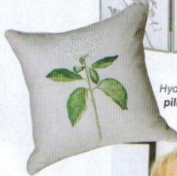
Hydrangea pillow, $295.