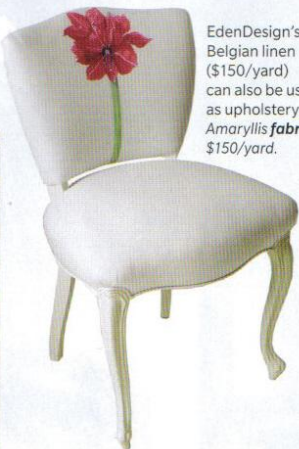
EdenDesign's Belgian linen ($150/yard) can also be used as upholstery. Amaryllis fabric, $150/yard.